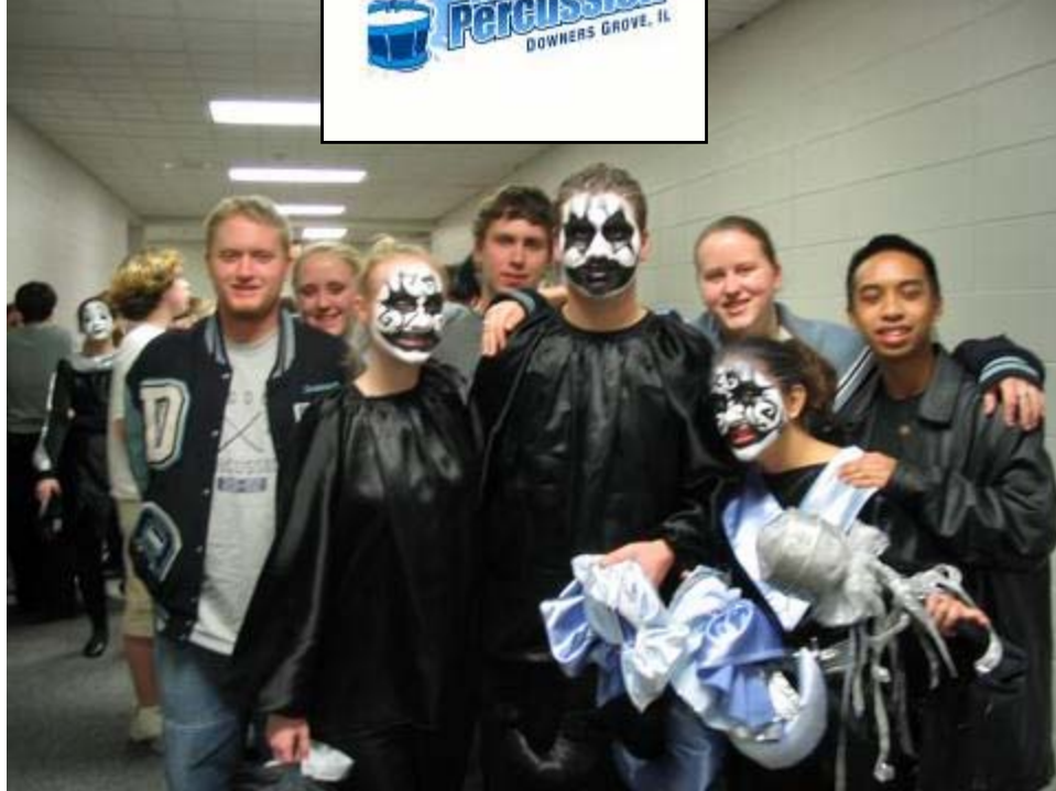
2004 Indoor Percussion